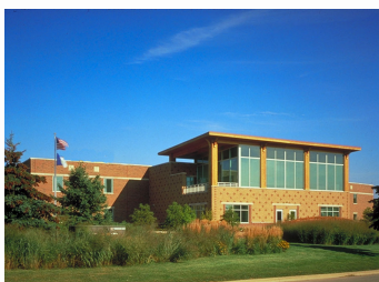
Planting and Paving Design