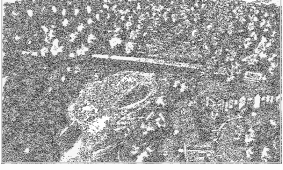
Neighborhood and Site Hydrology

The 400-acre project site along the Fox River at the interchange of I-80 and Route 71 creates a series of sculptural landscapes through ravines, wooded forests, and open meadows. The goal of this residential community is to create a neighborhood that responds and preserves this environment through conservation and sustainability.