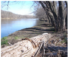
View along the Fox River