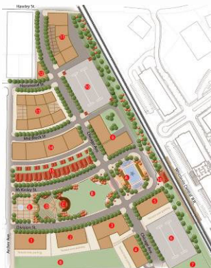
Preliminary Development Concept Plan