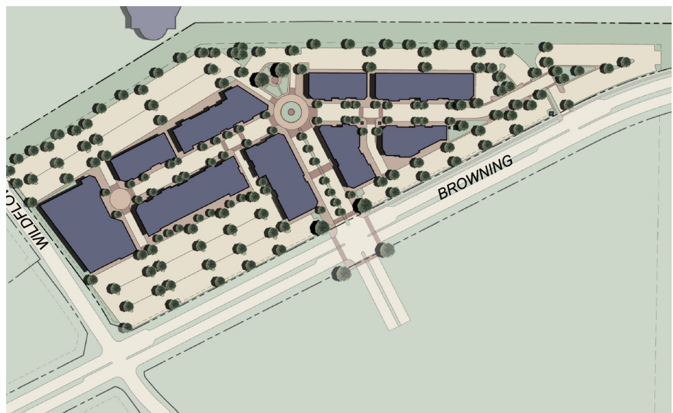
Rendered Site Plan